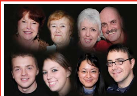
Kosair Charities Volunteer Appreciation Night honored hundreds of volunteers.